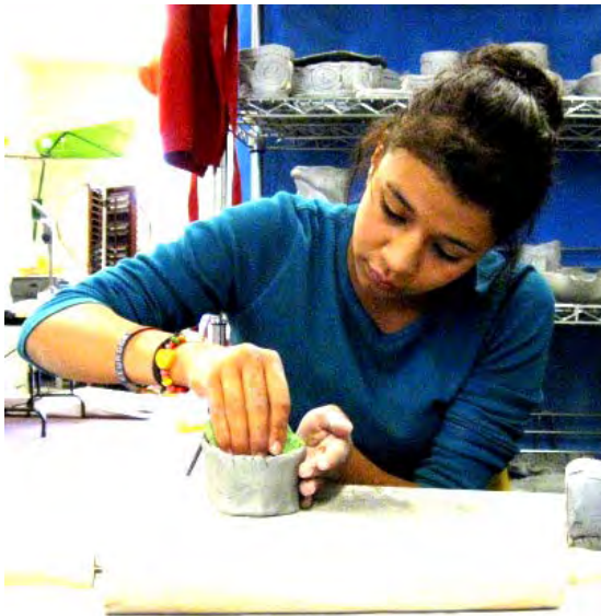
Below: High School art class in full swing!