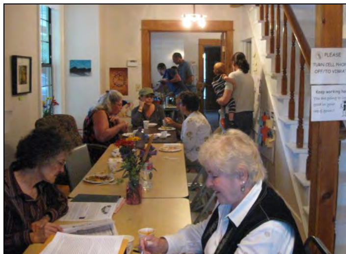
Board members, community members and parents alike enjoy each other’s company, our beautiful Greenville location, and good food.