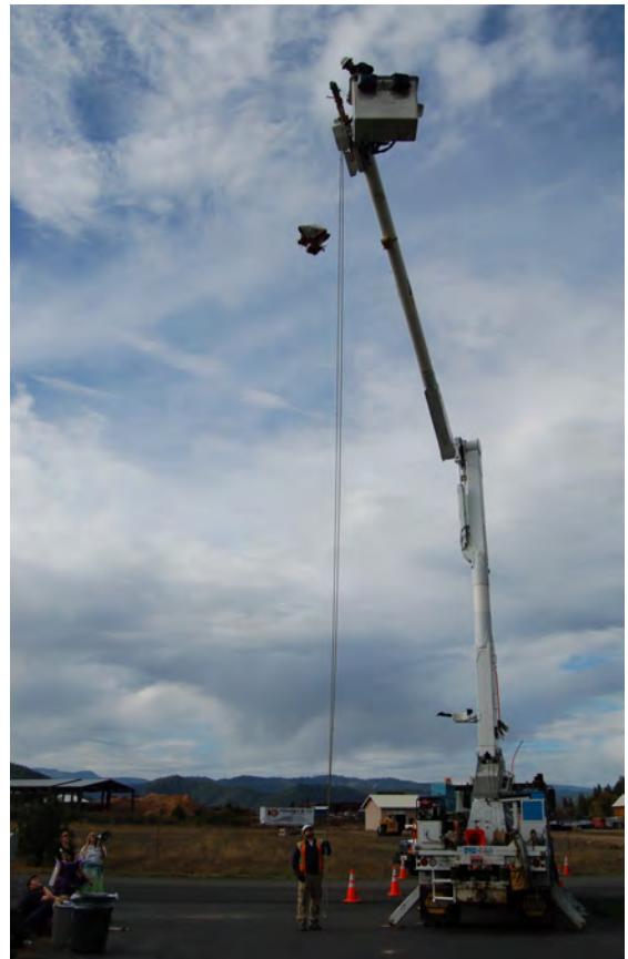
PG&E comes through again, volunteering their time, good humor, and equipment for our egg drop activity.